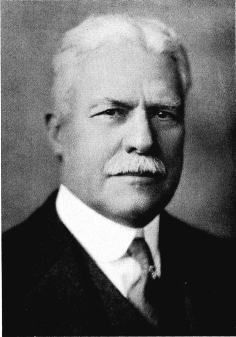
FOUNDER OF THE SOCIETY 1936